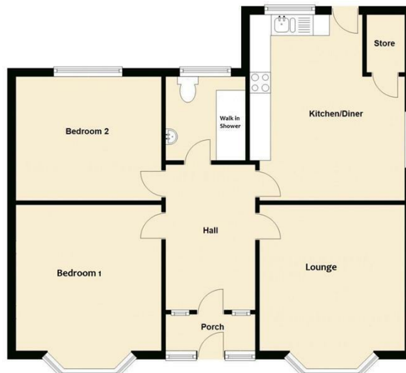
Total area: approx. 893.6 sq. feet

For Illustrative Purposes Only - all measurements, walls, doors, windows, fittings and appliances, their sizes and locations are shown conventionally and are approximate only and cannot be regarded as being a representation either by the Seller or his Agent. Copyright - Mayfair Town & Country. Plan produced using PlanIt.